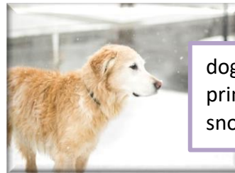
dog paw prints in snow

The swan's prints are flattened because they have webbed feet to help them swim. Many other birds like robins and sparrows have arrow shaped prints like those below.