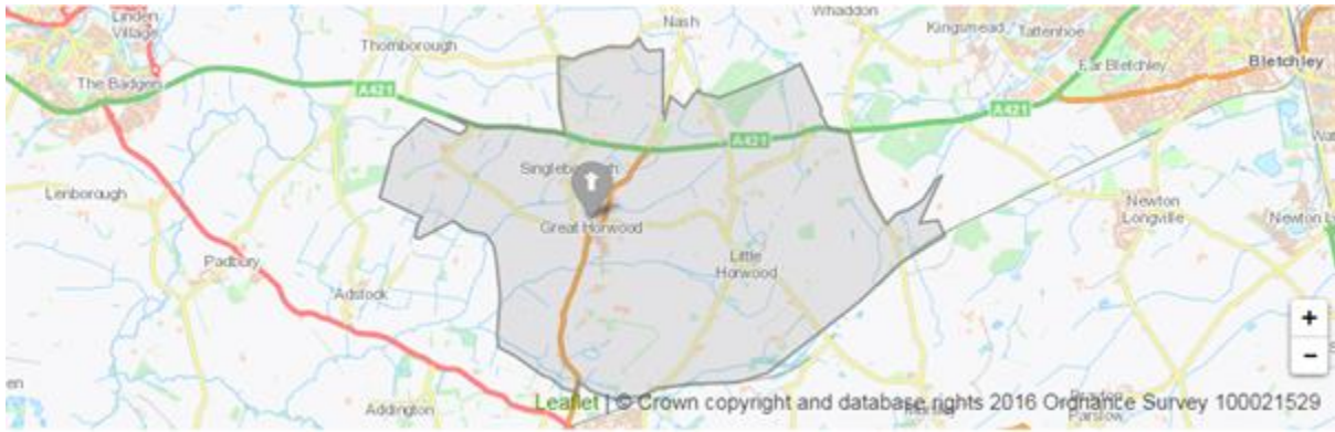
Key Stage 2 Catchment Area