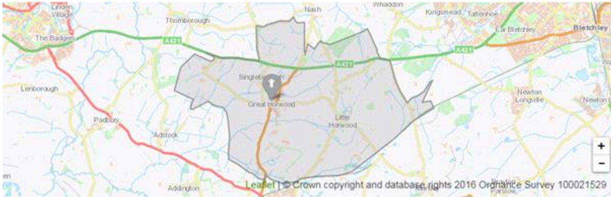
Junior Catchment Area